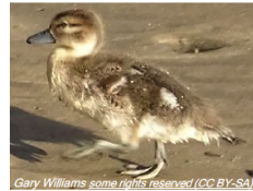
Grey teal/tētē ( Anas gracilis ) Details on pages 2, 11 and 12