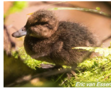
North Island brown teal/pāteke ( Anas chlorotis ) Details on pages 2, 9 and 10