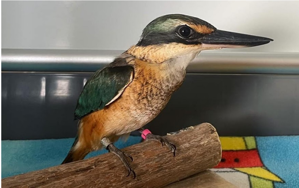
Kōtare with DOC band on right leg and BirdCare Aotearoa temporary in-house band on left leg.

This young kōtare arrived with an injured wing... and a Department of Conservation leg band! We were thrilled to find that this was one of the kōtare we had raised in our nursery last season. He had been thriving in the wild for several months post-release, until his accident. He was otherwise healthy and had a great body condition score. This is such useful information for us, as it shows that our young kingfishers are doing well following rehabilitation and release. After vet care, pain relief, bandaging, laser therapy, and physio, this little one was ready to be released for a second time. Fly safely little kōtare!