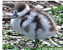
Paradise shelduck/ pūtangitangi ( Tadorna variegata ) Details on pages 3, 19 and 20