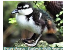
Blue duck/whio ( Hymenolaimus malacorhynchos ) Details on pages 3, 17 and 18