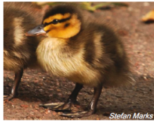
Mallard ( Anas platyrhynchos ) Details on pages 2, 5 and 6