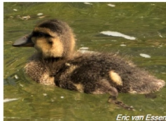
New Zealand shoveler/kuruwhengi ( Anas rhynchos variegata ) Details on pages 3, 13 and 14