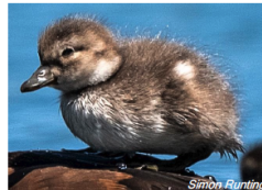
New Zealand scaup/pāpango ( Aythya novaeseelandiae ) Details on pages 3, 15 and 16