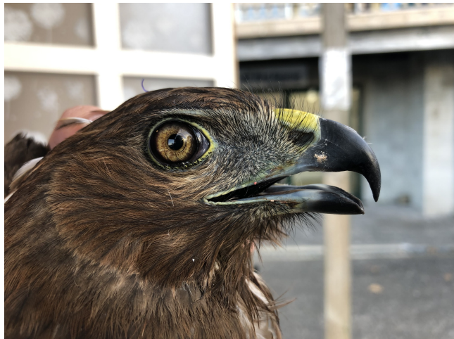
Image: One of two hawks in our care at the centre

at BirdCare Aotearoa, Green Bay, Auckland