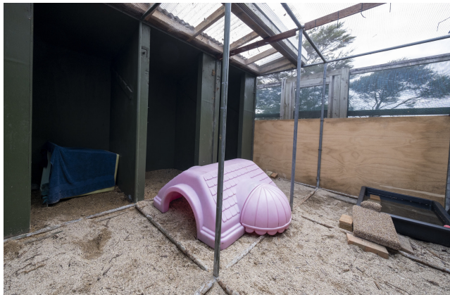
Image: Current waterbird enclosure

In March this year, hundreds of bird lovers like yourself gave generously to our matched giving campaign.