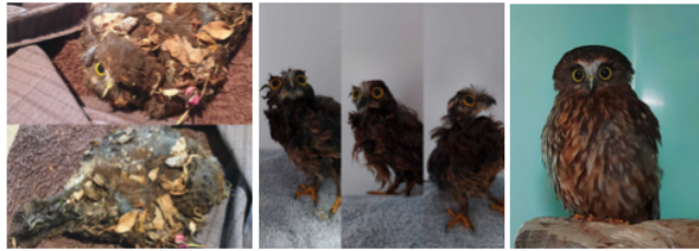
Image: A Ruru - before and after being caught in a Parapara Tree